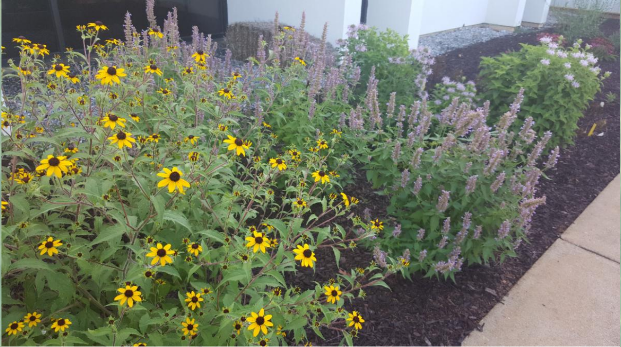
Photo: A small pollinator garden with Brown-eyed Susan ( Rudbeckia triloba ) and Anise Hyssop ( Agastache foeniculum ), both native plants to South Carolina.

Incorporating native plants into your landscape will not only save water, but it will save you a lot of time on maintenance, too.