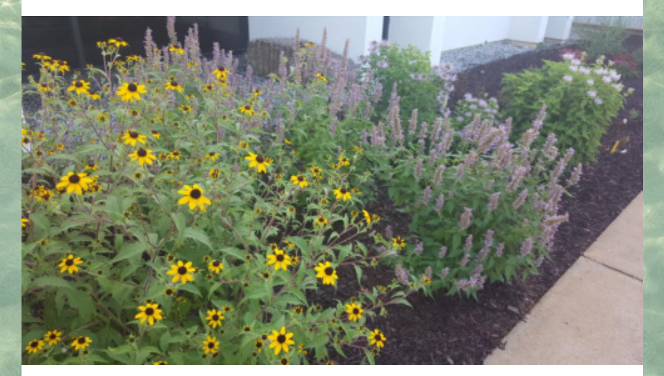
Photo: A small pollinator garden with Brown-eyed Susan (Rudbeckia triloba) and Anise Hyssop (Agastache foeniculm), both native plants to South Carolina.

Incorporating native plants into your landscape will not only save water, but it will save you a lot of time on maintenance, too.