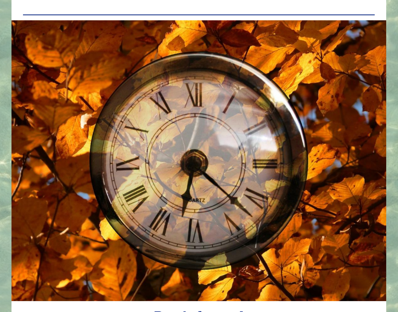
Don't forget! Daylight Savings time ends soon