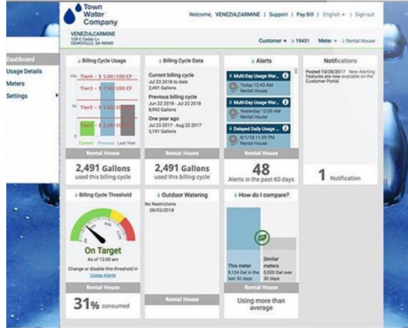
Water Usage Portal

your property here in Hilton Head while you are away. Set up text or phone alerts to signal you if your water usage exceeds a level you determine.