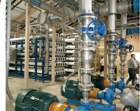
The interior of the PSD's RO Plant.

about half of the average daily demand for water. In 2013, the PSD began preparations to expand the plant's production to 4 million gallons a day. The RO Plant's construction was necessary to replace water supply lost to saltwa-