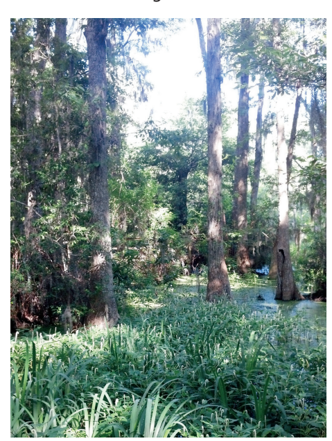
The PSD's recycled water nourishes the Whooping Crane Pond Conservancy in Hilton Head Plantation and three other wetlands.

ing the remaining treatment infrastructure from excessive wear and damage. The wastewater then flows to the aeration basin where microbes biologically break down or consume the organic matter. After aeration, the water